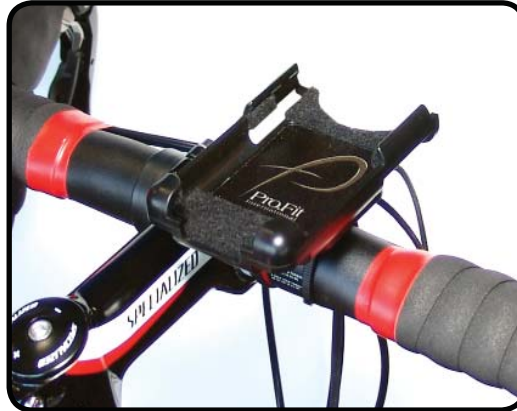
Contents: iPhone 4 holder, mounting base, zip ties, secure strap, rubber shim, logo sticker, hardware.

This holder will not protect your iPhone 3G/3GS from incimate weather or crashes. The manufacturer, distributors and retailers for this product may not be held liable for damage to you or your iPhone for any reason.